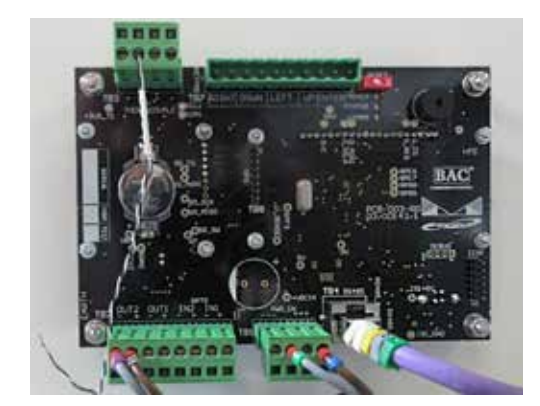
Infinity HMI Panel retrofitted to existing TR Facia Panel