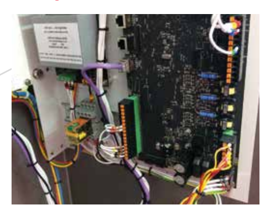
Infinity Control Board retrofitted to TR unit.