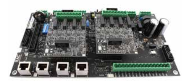
Infinity Thryistor control board