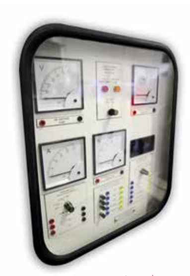
Conventional control panel