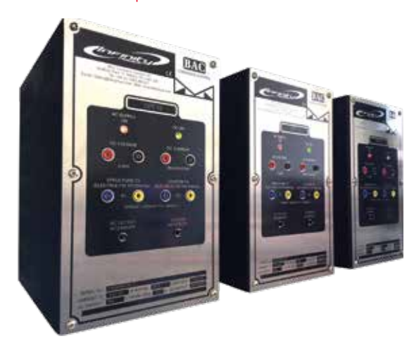
Modular Thyristor Controlled Power Supplies