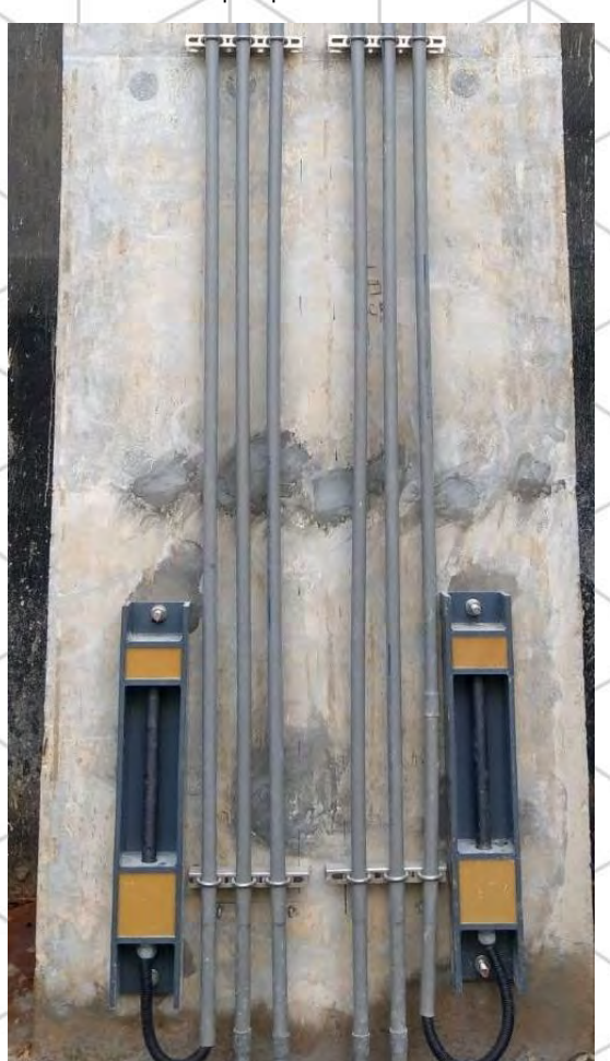
Mixed Metal Oxide Anodes for Water Intake Channel Structures