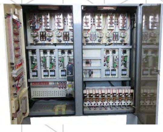
World class CP Power supplies bespoke to your system, manufactured in the UK.