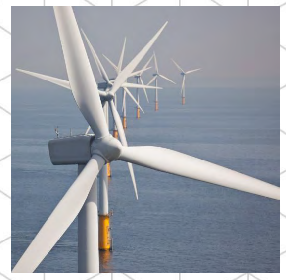
Renewable energy sources need CP too, BAC design internal & external systems for offshore monopoles -