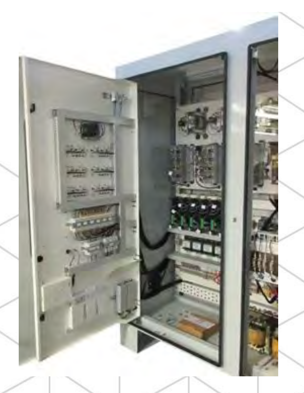
Multi Output Transformer Rectifiers for control over complex plant structures